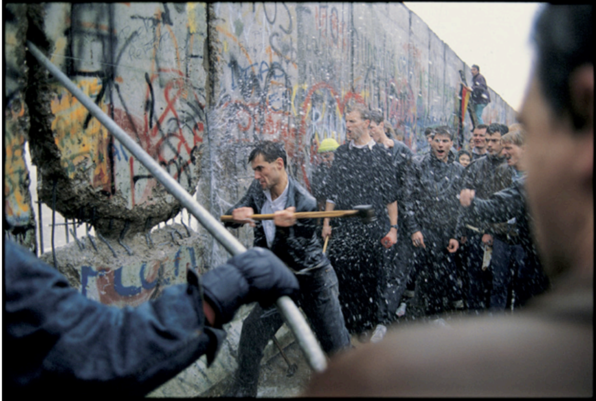
IMAGE © Alexandra Avakian Fall of the Berlin Wall, West Berlin, Germany, November 1989 Courtesy of Contact Press Images